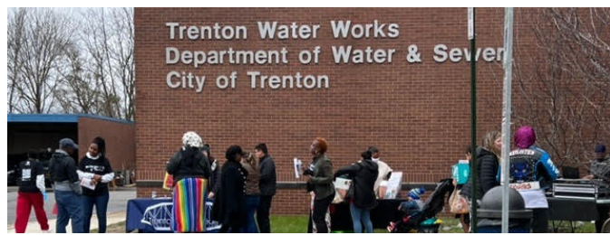
These grassroots organizations coordinate locally tailored efforts to educate and empower communities.